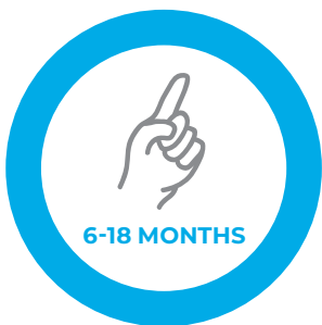
Pointing and Counting

A NEW WAY FOR YOUR PATIENTS AND FAMILIES TO HAVE FUN WITH MATH